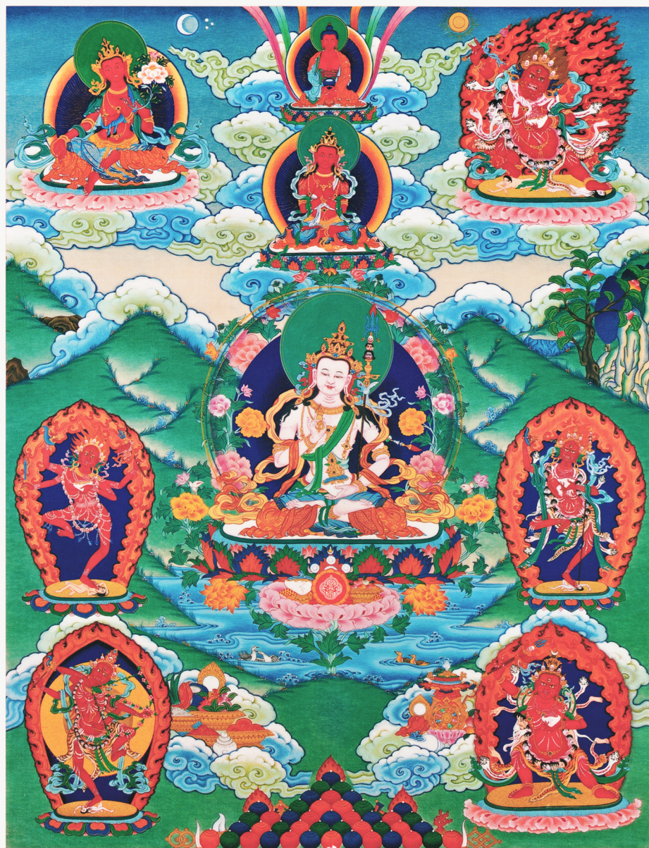
THE NINE DEITIES OF MAGNETIZING ACTIVITY