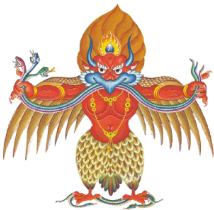
Cover Design by Wang Punkway