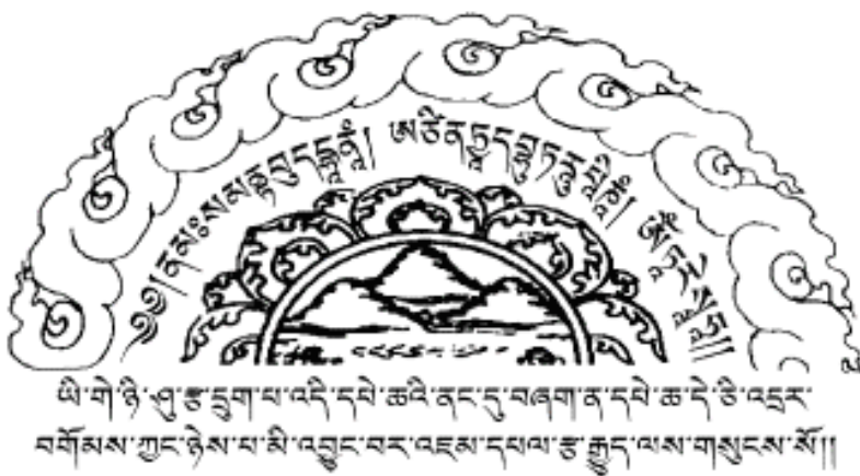
For Non-Commercial Use Only