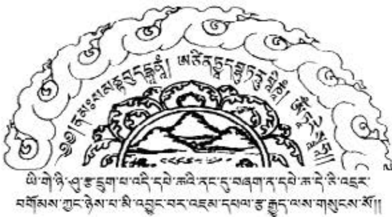
For Non-Commercial Use Only